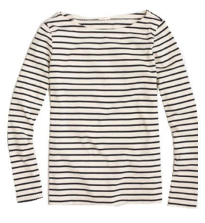
J Crew Factory